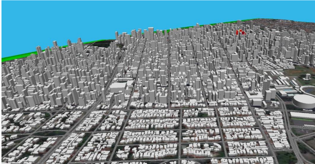
Fig. 1 – 3D View of the pilot area of São Paulo

The area of the city has approximately 3 km x 3 km area, including 12852 buildings and 665 roads / streets. Several calculation methods have been tested and compared with real measurements carried out by the Working Group. The results and conclusions of the above-mentioned comparison are not part of this contribution.